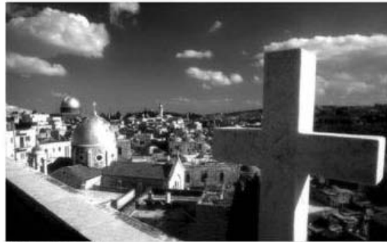
The old city of Jerusalem

“Behold (O Mary!)’ The Angel said, ‘God has chosen you, and purified you, and chosen you above the women of all nations. O Mary, God gives you good news of a word from Him, whose name shall be the Christ (Masih or Messiah), Jesus son of Mary, honored in this world and in the hereafter, and one of those brought near to God.” (Holy Qur’an, 3:45)